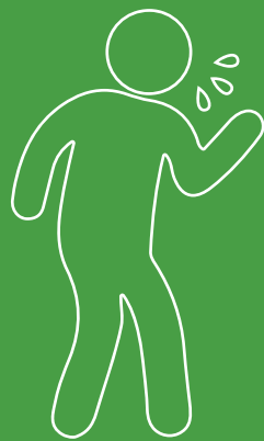
Cough, sore throat, or difficulty breathing