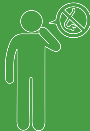
Recent loss of taste or smell

Employees: if your health-care provider suspects or has confirmed that you have COVID-19, call your immediate supervisor so they are aware, and contact Employee and Labor Relations, Human Resources at UOELR@uoregon.edu or 541-346-2972.